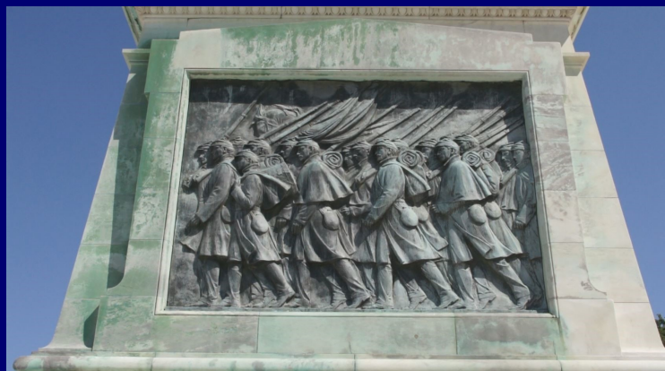
The Ulysses S. Grant Memorial in Washington DC. Shot hand held and in a still taken from the clip in post-production. A slow zoom was used in post-production to move slowly towards the troops.