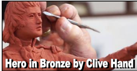
Hero in Bronze by Clive Hand

colourful with the narration in rhyme. Appropriate music accompanied and overall very enjoyable.