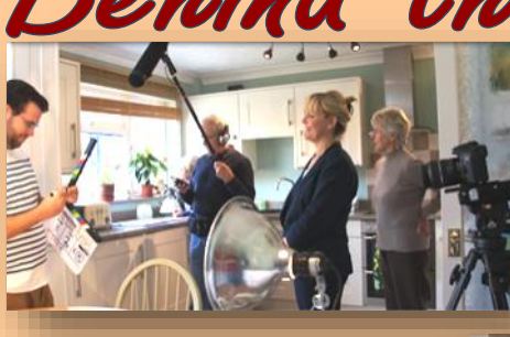
Three Canon DSLRs cameras were the equipment of choice for this club production.

An important part of any film shoot is to keep your cast and crew 'fed and watered'.