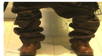
Opening shot from 'OTHERWISE ENGAGED'

be our last visit. There is however, a Premier Inn next door. Hmmm!